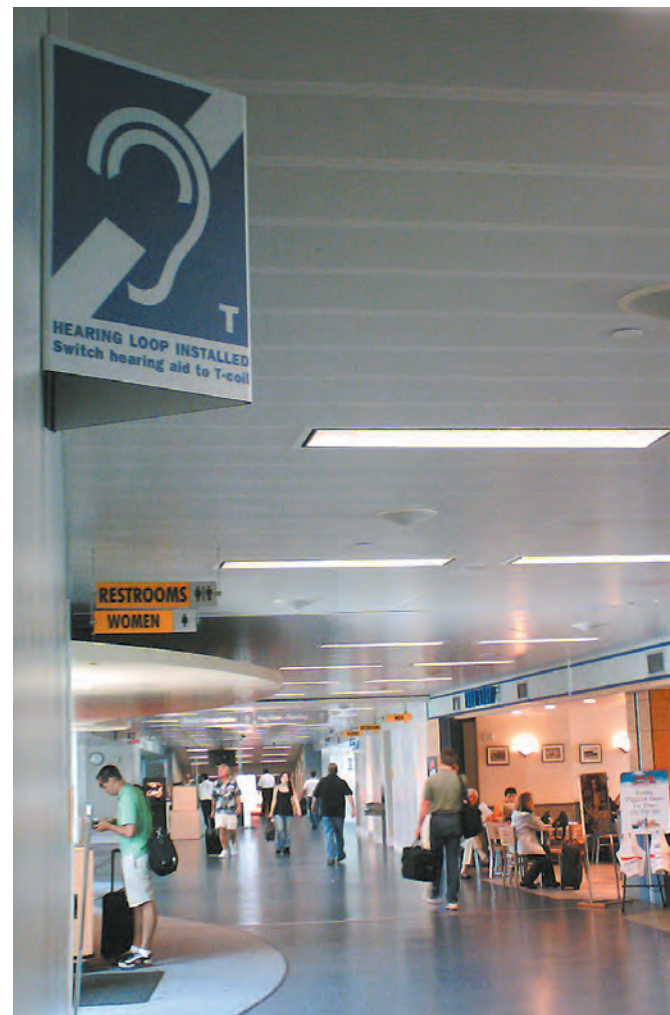
Loop Concourse at the Grand Rapids, Michigan International Airport