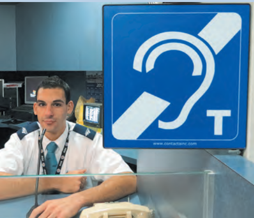
Penn Station customer service window in New York City, NY

Contacta was the provider of looping services for the 2012 Annual IHS Convention and Expo in Glendale, AZ.