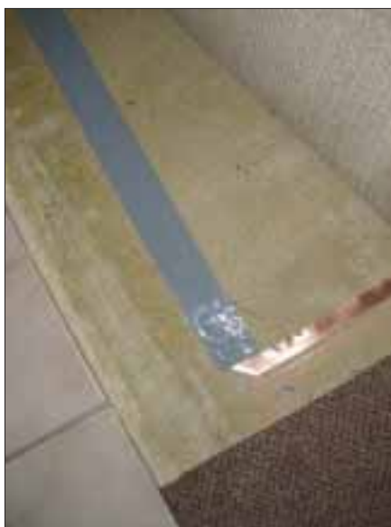
Hearing loop wire placed and taped down to the floor before the carpet is placed back in position.