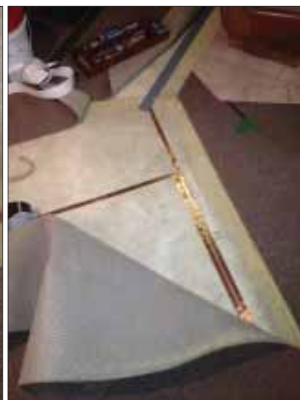
Sometimes more than one wire placement is needed to ensure the entire sanctuary is hearing loop capable.

loop in the audio rack as it crosses mic lines or video cables.