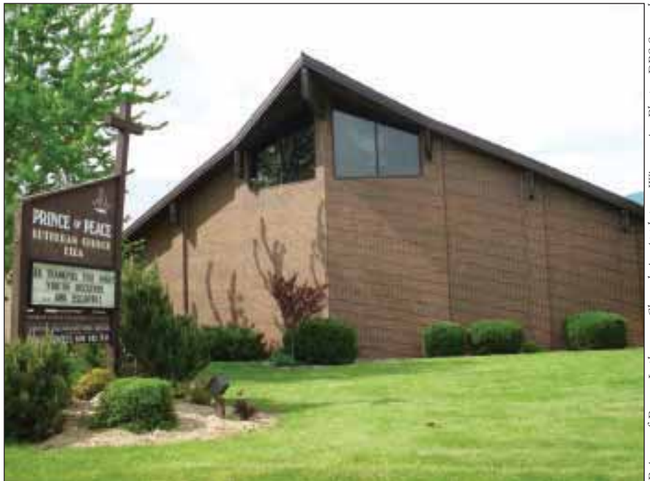
Prince of Peace Lutheran Church in Appleton, Wisconsin.

T he first thing your integrator needs to do when installing a Hearing Loop system in your House of Worship is run a site assessment. This assessment will measure EMI background noise and tests for field strength and frequency response to determine adverse effects from metal or steel in the floor or building. The installer uses these readings to determine the loop width and design needed to meet the IEC60118-4 standard for hearing loops and determine the size of the loop wire and driver required.